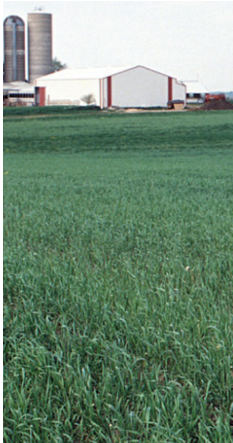
Cover crops on a field in Black Hawk County, Iowa.